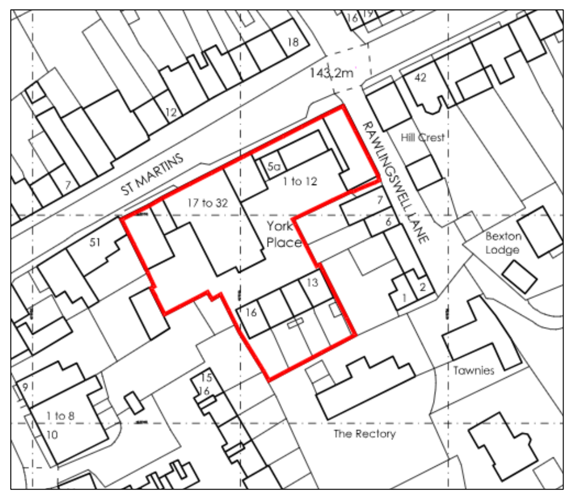
Extract from OS Site Location Plan.